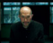
徐錦江 Elvis Tsui