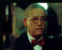
吳耀漢 Richard Ng